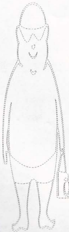
AFTER SIX WEEKS TRAINING WITH TRENTHAM RUNNING CLUB!!!!

Please do not be too critical over the layout. Just send a bag or two of experience plus one of spelling!