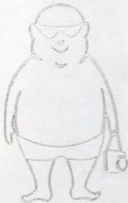
TYPICAL NEW MEMBER ON ARIVAL